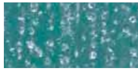
Their one-coat polyester paint

Two-coat acrylic finish gives Trim Coil by NAPCO® by Ply Gem an ultra-thick surface that resists scrapes and scratches.