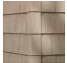
Cedar Select® Shingle Siding