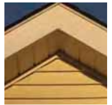
Woodgrain Embossed Fascia