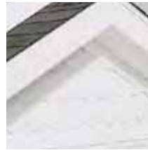
Cedar Select® Round Cut Siding

NAPCO® by Ply Gem offers a full line of attractive, durable, maintenance-free vinyl and metal exterior design products to complete the look of your home. From our weather-resistant Aluminum collection to our authentic Cedar Select® Shingle or Round Cut siding, we have everything you need. And that's not all. Our coordinated enhancements including Monticello Columns®, Richwood® Exterior Finishings, Ply Gem stone veneer, Gutter Warrior™ hanging system and Leaf Relief® gutter protection — all by Ply Gem — provide the perfect finish with minimum maintenance. More looks. Less work. That's Ply Gem.