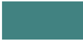
NAPCO® two-coat acrylic finish