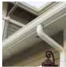
Elbows, Downspouts and Gutter