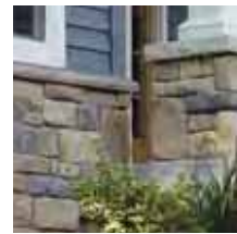
Ply Gem Stone