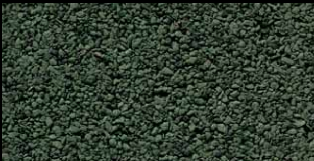
EMPIRE GREEN BLEND ●