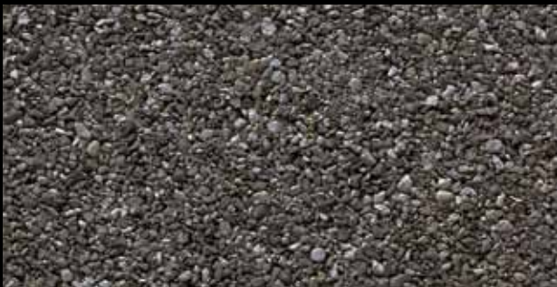
ANTIQUÉ SLATE ●◆