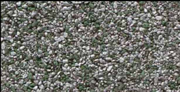
PASTEL GREEN ●