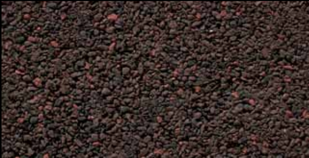
RUSTIC REDWOOD ●◆