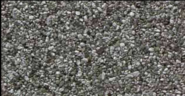
GREY BLEND ●