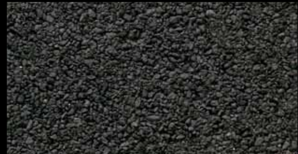
RUSTIC BLACK ●◆