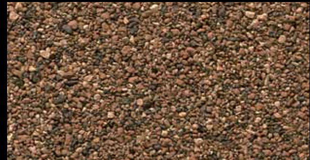
RUSTIC CEDAR ●◆