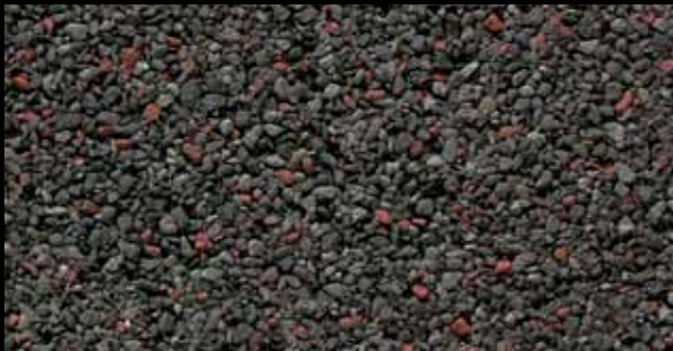
SLATETONE GREY ●