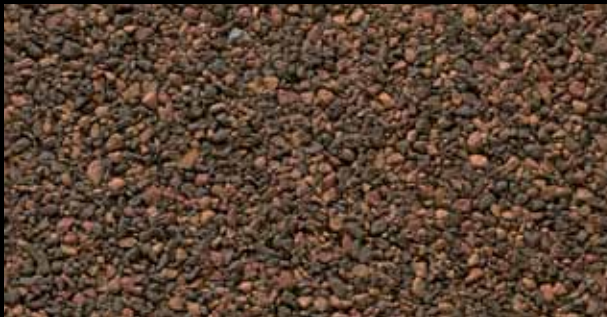
TWEED BLEND ●◆