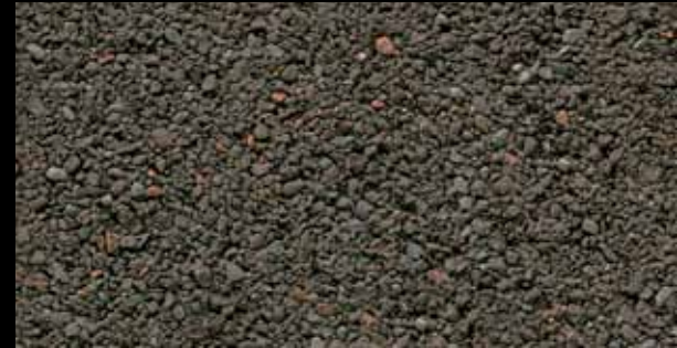
WEATHERED WOOD ●◆