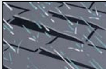
Wind-blown rain trapped under your roof's top layer seeks out those channels.