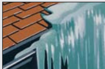
Backed up at the eaves by ice dams, melting snow finds access the same way.