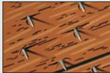
Nail holes and joints in your roof deck provide the channels for water to seep through.