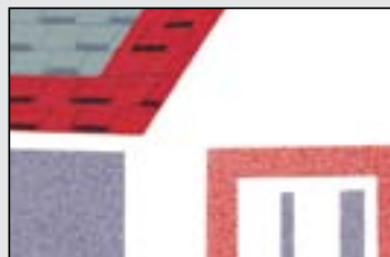
Applying a layer of Moisture Guard Plus to the deck at all rake and eave edges a minimum of 24" beyond the interior wall line will provide a last line of defense against leaks, to help prevent backed-up water from getting into the home.