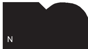
M 52 13/16" x 1 1/2"