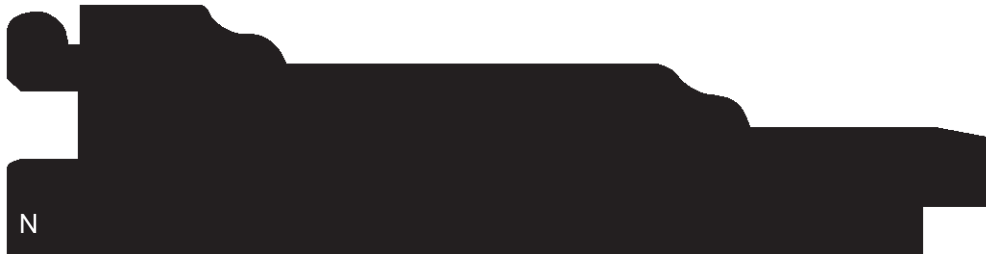
P 146 1 1/4" x 5 1/8"

S = Stock, mainly Oak & Poplar N = Non-stock, subject to stock on hand