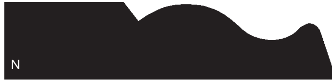
P 116 13/16" x 3 1/2"