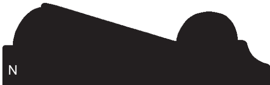
M 432 7/8" x 2 13/16"