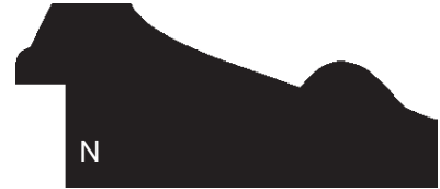
M 222 7/8" x 2"