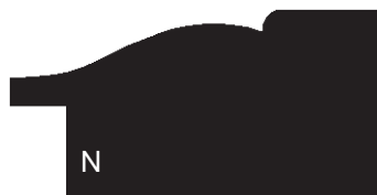
P 112 7/8" x 1 3/4"