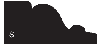
M 69B 3/4" x 1 5/8"