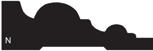
M 416 13/16" x 2 1/2"