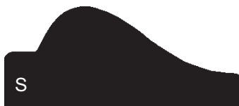
M 26 3/4" x 1 3/4"