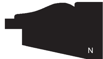
P 73 1" x 1 3/4"

S = Stock, mainly Oak & Poplar N = Non-stock, subject to stock on hand