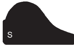
N 60 3/4" x 1 1/4"