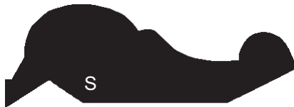
N 31 3/4" x 2 1/8"