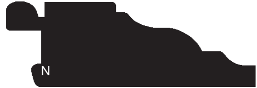
P 144 7/8" x 2 5/8"