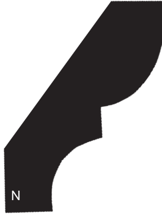
M 382 3/4" x 2 3/4"