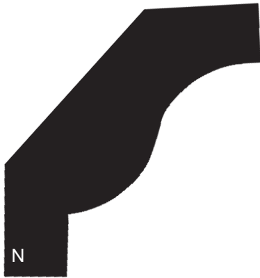
M 270 7/8" x 2 3/4"