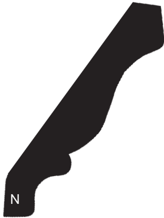
M 459 1/2" x 2 11/16"