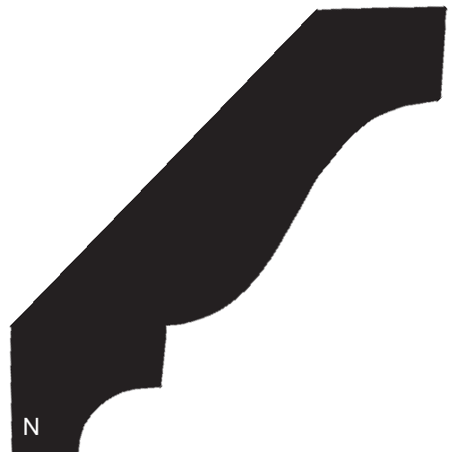
M 40 7/8" x 3 5/8"