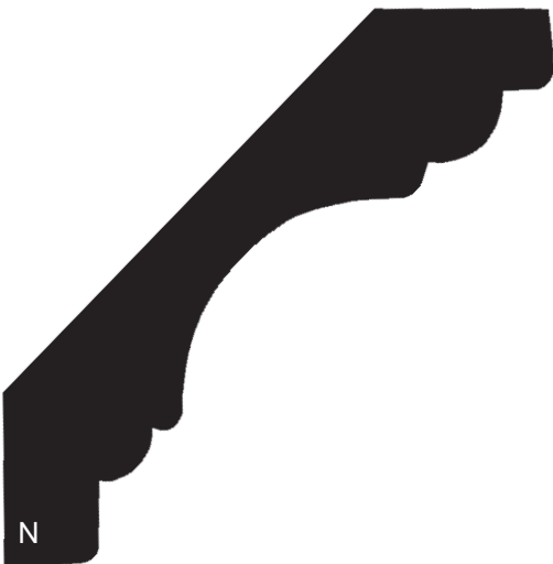
M 298 13/16" x 3 5/8"