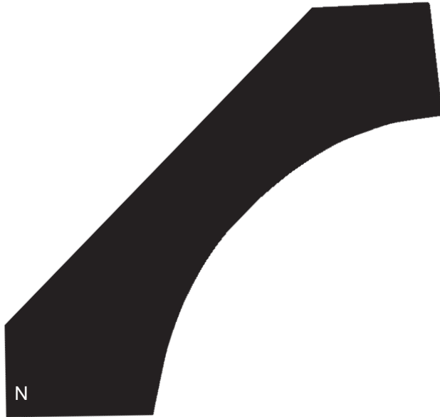
M 262 1 1/4" x 4 3/8"