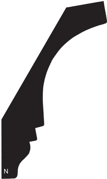
M 481 7/8" x 4 1/2"