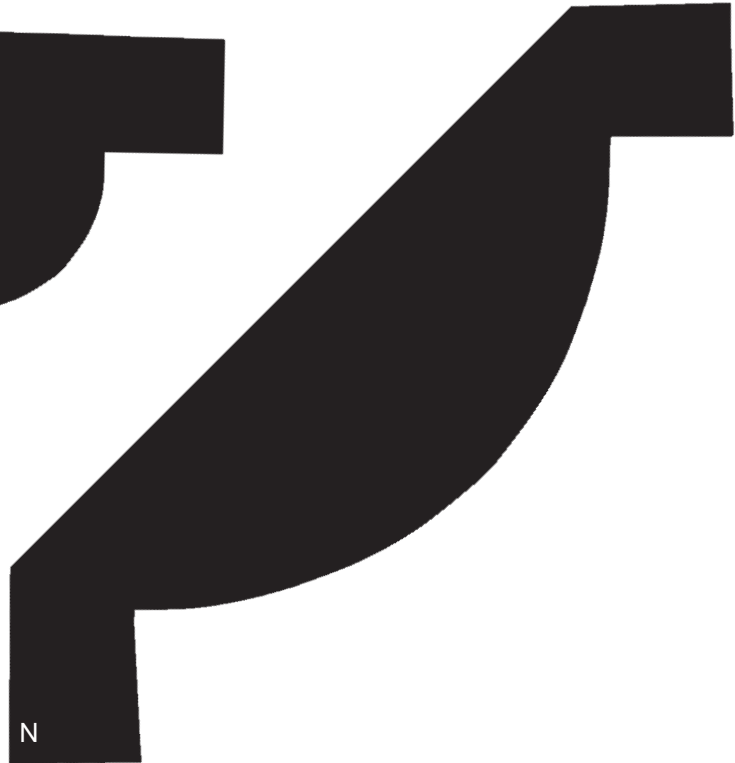
M 272 1 3/8" x 5 7/16"